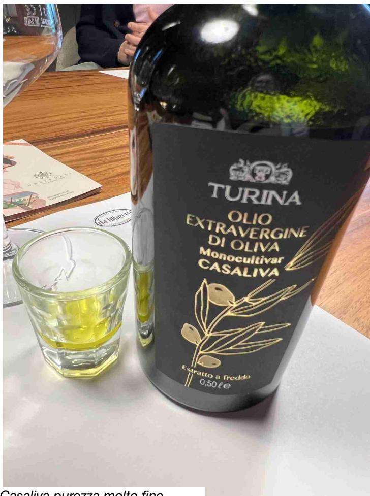
Casaliva purezza molto fine

Here, wine seems as if it has always been there – and yet, not necessarily so. Between history and family stories, you discover it truly begins with the fourth Turina generation, a contemporary wine era still rooted in its homeland. It starts with young people capable of “precision viticulture,” as they call it, and you grasp the meaning of wine (the sixth natural sense) for these people: in one of the symbolic wineries of Valtenesi and Lugana.